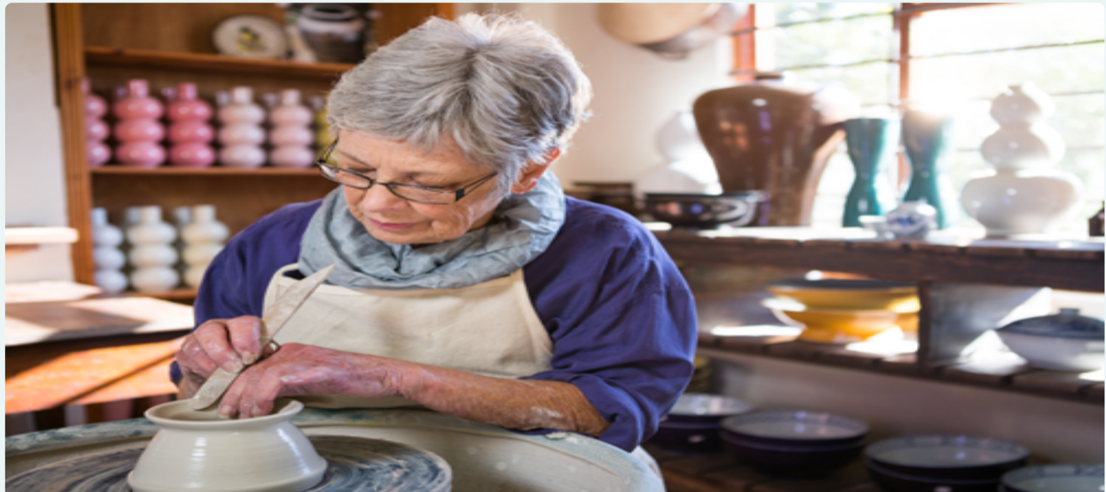
People at Increased Risk